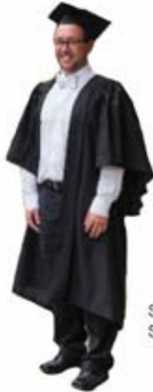
Sub Fusc Scholars Gown