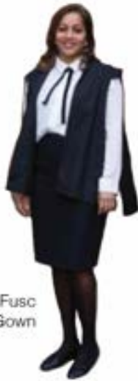
Sub Fusc Commoners Gown