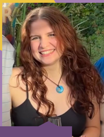
'pre-drinks over prelims'